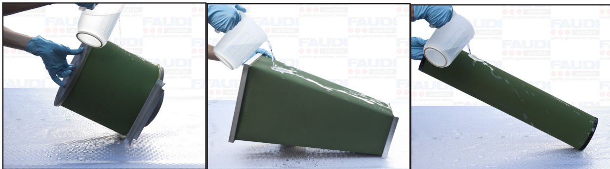
Fig. 2a: wrong