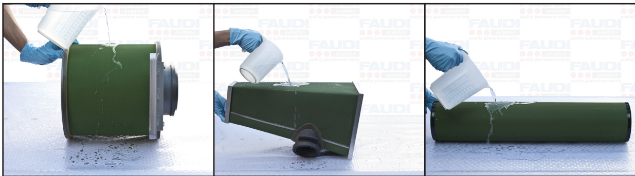
Fig. 1a: correct

Hold the element as shown in figures 1a-c and slowly pour clean tap water on the coated screen from a height of approx. 1" (2,5 cm). Do not spray the water. Avoid making gushes or jets of water. Do not pour the water from more than 2" (5 cm) above the element. Ensure that the water can run freely over the surface of the element. Rotate the element so that water can flow over the entire screen surface and every portion of the screen comes in contact with the water. Hold the upper side of the Teflon® coated screen in horizontal position to ensure that the water does not cascade on to the folded-over edges of the end caps where the screen is held. If the water were to penetrate at this point, this would give a false test result.