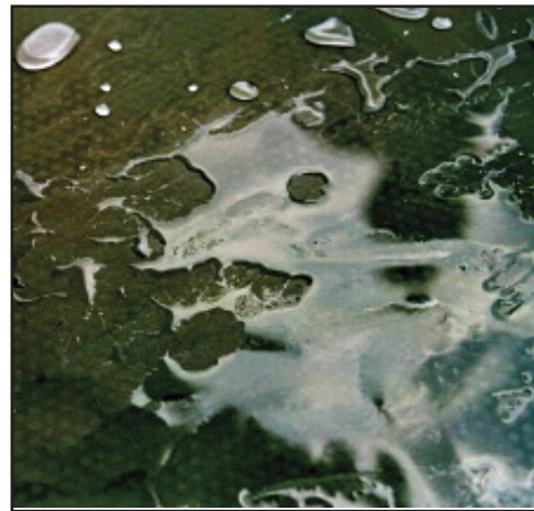
Fig. 3b: wrong