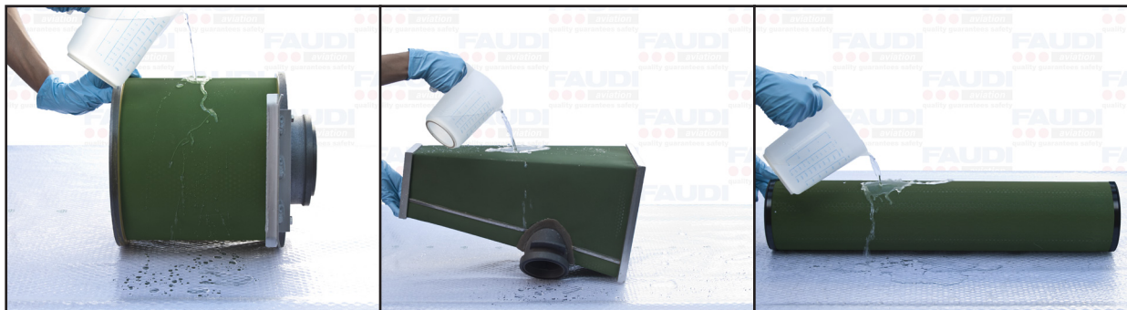
Fig. 1a: correct

We recommend testing the separator element according to JIG 1, A5.2.4: "[...] The separator(s) needs to be completely wet with aviation fuel to perform a valid test [...]."