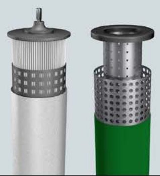
FAUDI Aviation Coalescer and Separator